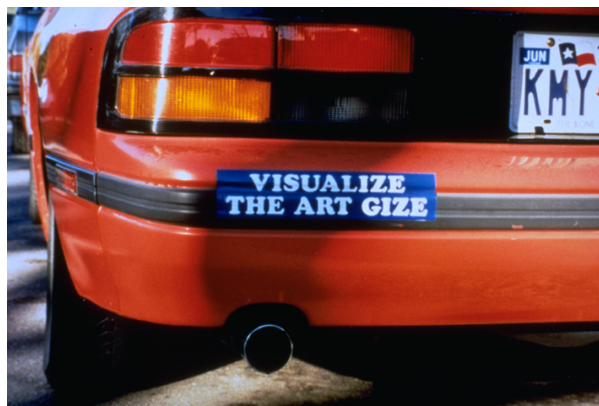
The Art Guys, bumper sticker, 1991