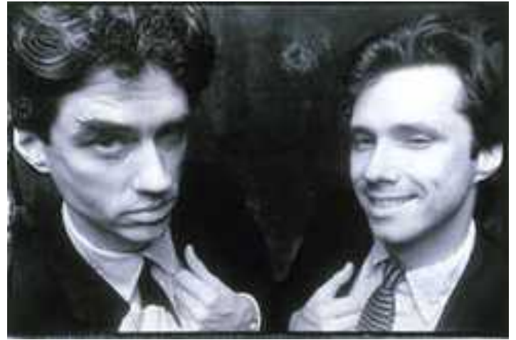
The Art Guys

By creating their work from the most ordinary objects of our daily lives, the Art Guys recognize that we can be enriched by simply experiencing the quotidian as mysterious, funny, beautiful, and absurd. Through their quirky materials, they encourage us to think about the various meanings and experiences that can be culled from our everyday language and ephemera. At the same time, their playfulness also encourages us to chuckle at ourselves and the things we find around us. Because the objects that comprise their art are often funny (such as carrots, which may not be funny in and of themselves but become comical when made into art), the viewer may suspect that the Art Guys are giggling while creating their work and enjoying our reactions. However, unlike the mockery that informs some contemporary art, the Art Guys' bemused outlook on life encourages us to